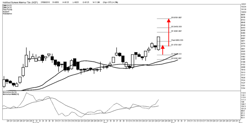
Kinerja saham INDF

Danareksa research report are also available at Reuters Multex and First Call Direct and Bloomberg